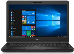
Dell Latitude 5490 Core i3 8th Gen