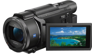
Sony AX53 Camcorder