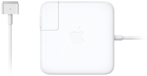
Apple MagSafe 2 Charger