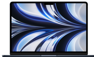
Macbook Air M2