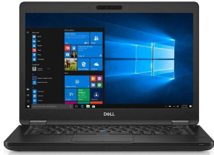
Dell Latitude 5490 Core i3 8th Gen