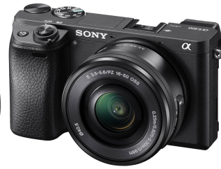
Sony a6300 Mirrorless A6